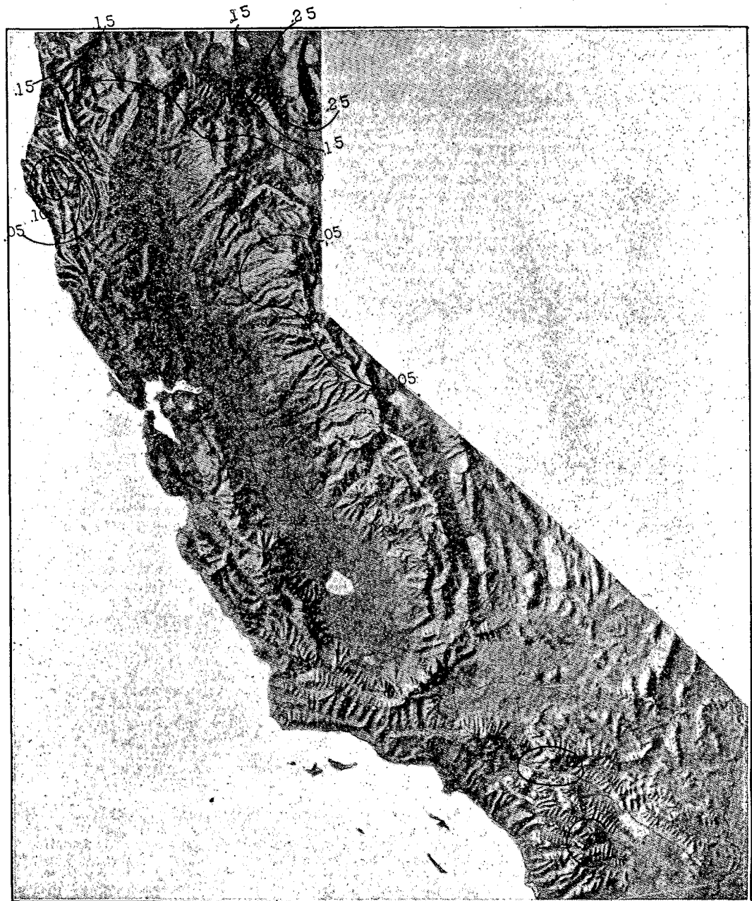
The influence of the diversified topography of California upon its precipitation is shown by the lines of equal rainfall in inches, on the accompanying relief map.