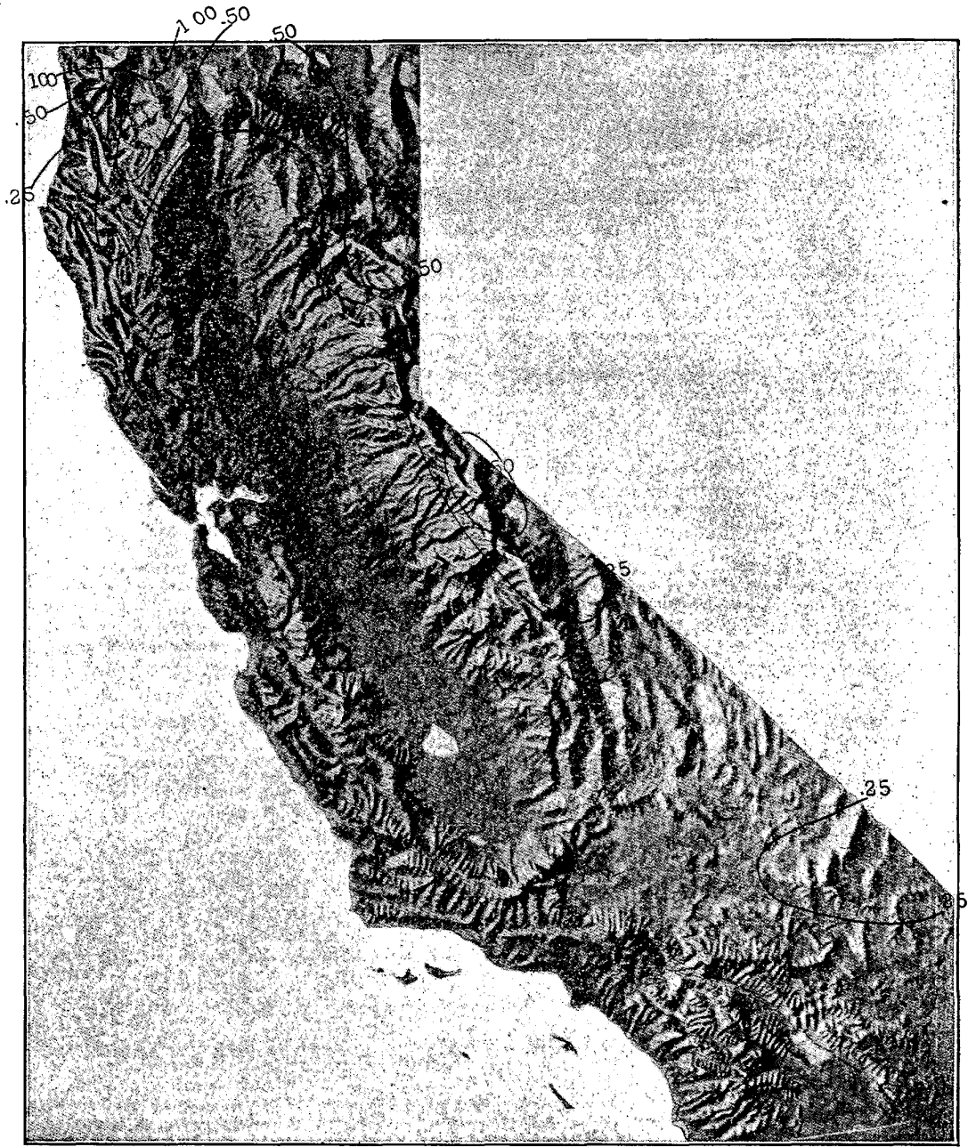
The influence of the diversified topography of California upon its precipitation is shown by the lines of equal rainfall in inches, on the accompanying relief map.